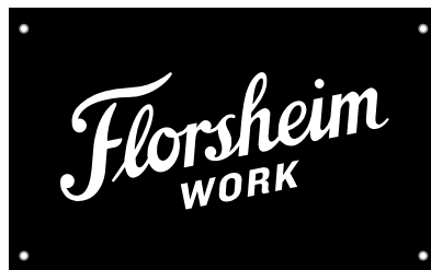
Logo Banner (with grommets) PFGB Dimensions: 30" x 18"