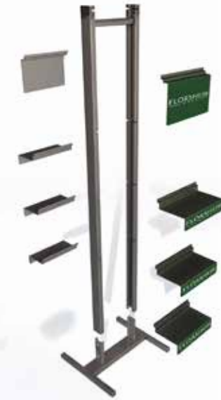
Free Standing Display Base Unit FSUNIT Dimensions: 60.78" x 16.50" x 16.32" Color of Base: Gun Metal Shelves and headers not included