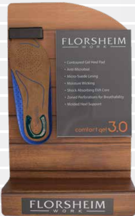
Florsheim Comfort Gel 3.0 Slot Wall Display Shelf FLCGD Dimensions: 12" x 19.25"