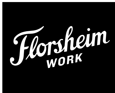
Carpet Logo Mat PFRUG Dimensions: 3' x 4'