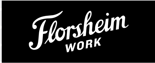
Slot Wall Header FLHEADER Dimensions: 24" X 9.75" X 1.13"